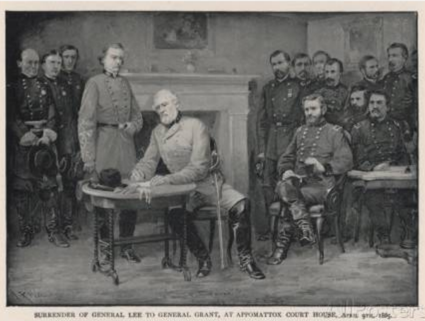
SURRENDER OF GENERAL LEE TO GENERAL GRANT, AT APPOMATTOX COURT HOUSE, APRIL 9TH, 1865.